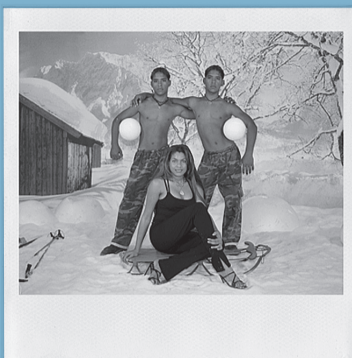
Turismo, La Habana, Cuba, 2000

Tuesday, 09.06.2009 at 19:00 G-MK | Galerija Miroslav Kraljević Šubićeva 29, Zagreb