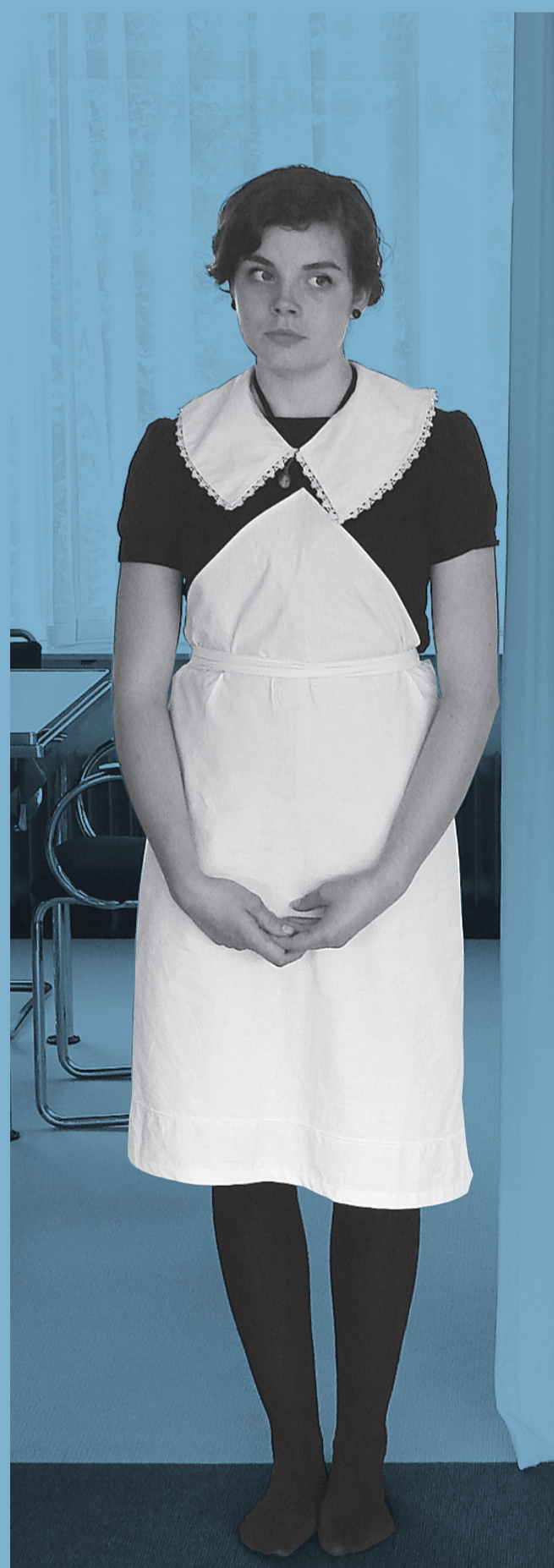
This Functional Family, Rotterdam, Netherlands, 2007