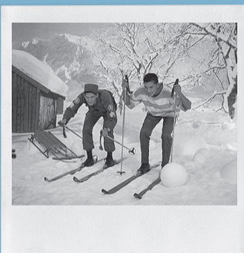
Turismo, La Habana, Cuba, 2000

Njezini su radovi, između ostaloga, izlagani u Tate Modernu u Londonu, De Appelu u Amsterdamu, Muzeju suvremene umjetnosti Aldrich u Ridgefieldu (Connecticut) i Centru za suvremenu umjetnost u Vilniusu (Litva). Werthein je također sudjelovala na Manifesti 7 u Bolzanu (Italija), InSite_05 u San Diegu i Tijuani, Bienal de Pontevedra u Galiciji te na 7. bienalu u Havani (Kuba).